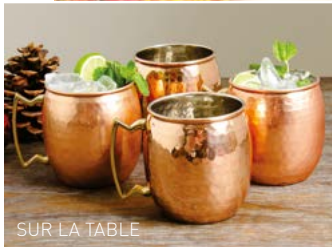
SUR LA TABLE