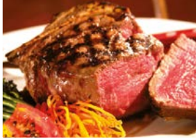
HYDE PARK PRIME