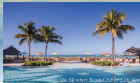
The Members Beach Club on Lido Key