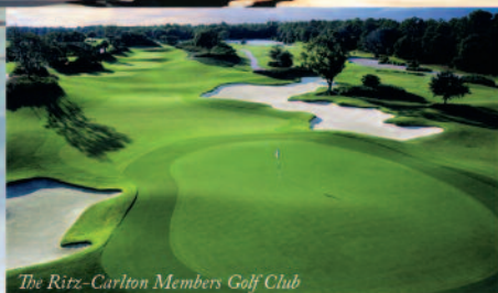
The Ritz-Carlton Members Golf Club