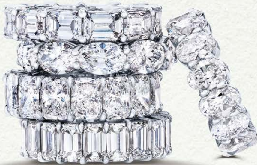
Classic diamond eternity bands in select sizes and shapes