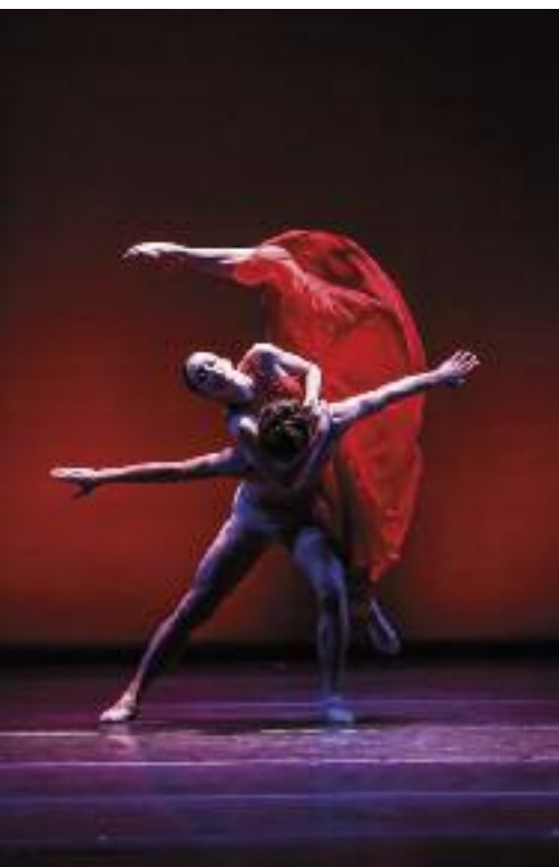
LEFT: Sarasota Cuban Ballet, courtesy of Soho Images.