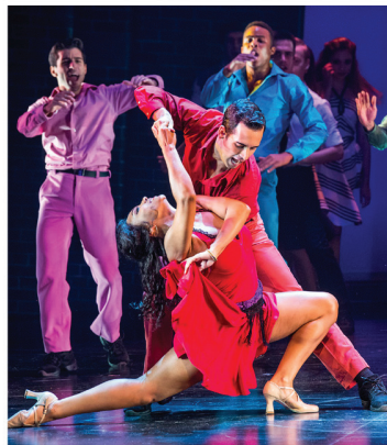
The cast of West Side Story.

NOW IN ITS 59TH SEASON , Asolo Repertory Theatre is recognized as one of the premier professional theatres in America and one of the largest in the Southeastern United States. One of the few select theatres in the nation that performs in true rotating repertory, Asolo Rep's highly skilled acting company and extensive craftsmanship bring to life this unique performance method, giving audiences the opportunity to see on the same stage multiple productions in the span of a few days. Asolo Rep is committed to expanding its reach into the community, collaborating with the best theatre artists in the industry today and cultivating new artists through its affiliation with the FSU/Asolo Conservatory for Actor Training.