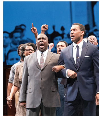
The cast of The Great Society.

"At this time, when the world needs a sense of cohesion and shared values, Asolo Rep is deeply committed to telling the stories that make people feel that they need to come to the theatre – the stories that we must hear again and again, and also experience in new ways. From the passion that fuels Evita , to the artist yearning for inspiration in Shakespeare In Love , the idea of love having no expiration date in Morning After Grace , the cautionary tale of conformity in Rhinoceros , the urgency of women's rights in Roe , the isolation of the modern workplace in Gloria , the power of immigrant voices in Ragtime , to the exploration of humankind's distinct relationship with nature in the world premiere of Jungle Book – the 2017-18 Season, Staging Our World , is about championing the artists and stories that could not be more crucial."