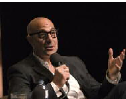
LEFT: Stanley Tucci at the 2016 Sarasota Film Festival.