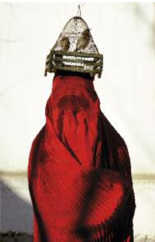
THIS SPREAD CLOCKWISE: National Geographic's "50 Greatest Photographs", South Florida Museum: Kabul, Afghanistan 1967  (red fabric and birdcage); California, United States, 1997  (futuristic plane); and Moscow, Russia 1983  (pears on a windowsill)