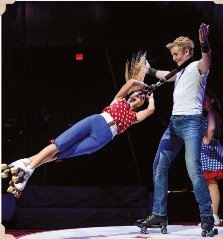
Circus arts training builds trust, skill and discipline.