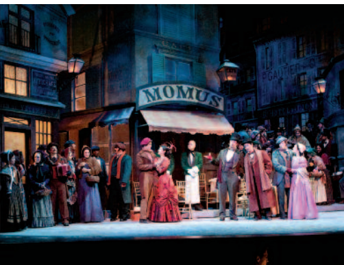
LEFT: Sarasota Opera's La Bohème .

the exhibition provides a more complete understanding of the visual and religious worlds of Ming princes and demonstrates the vital role of their courts in shaping Ming material culture.