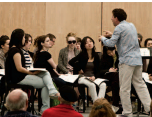
LEFT: The Perlman Sarasota Winter Residency.