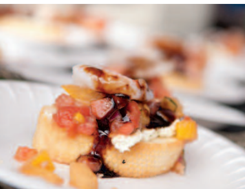
LEFT: Forks and Corks Grand Tasting at the Ringling Museum Courtyard.