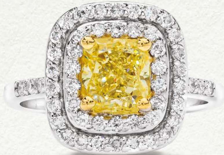
From the Yellow Diamond Collection