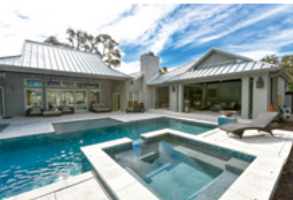
OUTDOOR SPACE — NUTTER CUSTOM CONSTRUCTION

NUTTER CUSTOM CONSTRUCTION TJ Nutter of Nutter Custom Construction describes the outdoor living space as becoming a popular request amongst his clients. "Outdoor space is huge. Everyone is really going over the top with their outdoor spaces" he says. This can range anywhere from outdoor kitchens, covered lanais, pools and fire pits. Utilizing the outdoor space for living and entertaining has been a trend that doesn't seem to be slowing down any time soon. It creates an additional space that you can customize and with the beautiful weather in Florida, it can be used year-round making it even more