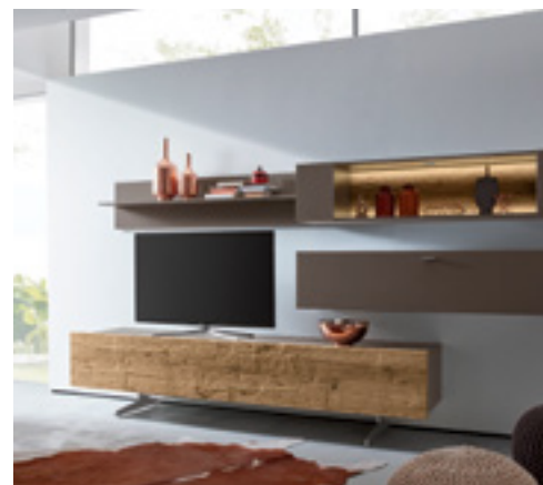
ORGANIC COLORS — COPENHAGEN IMPORTS

homeowner; they mirror their personality, their taste, their style. Even the most discerning art lover can get excited about the quality and variety of art on display at Art Uptown — everything from traditional oil paintings and sculptures that you might see in a museum to whimsical paintings, contemporary acrylic and watercolor works, photographs, glass art and ceramics, to off-the-wall pieces that attract a special type of