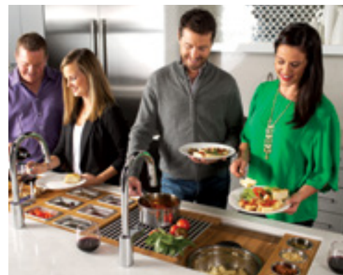
THE GALLEY WORK STATION — THE PLUMBING PLACE

ture-like piece, this elegant tub has a transitional look and is halfway between traditional and contemporary. What sets this tub apart is that it looks like it is a freestanding tub, but it is actually not. You can see that all three sides are finished and it looks like its sitting out in the open but it isn't. It's pushed against a wall and has an open section in the back to accomodate plumbing" says Smithman. "People really love it because they're after that look but don't necessarily don't want to break the bank on the freestanding tub-filler, which can cost as much as the tub itself." Another popular item for Smithman is The Galley Workstation. When he began advertising and offering this item about two years ago, he would have been content selling 1-2 a year. Word spread and currently, it is their number one seller of any product in the showroom, selling an average of 5-6 a week. This workstation ranges from 2ft – 7ft options and has amazing space-saving add-ons such as colanders and cutting boards. Smithman says it's not just a place to wash up, but also a place to prepare, serve, clean and most importantly, entertain. Swing by their showroom to see both of these items and much more.