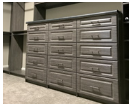
CUSTOM CLOSET STORAGE — TAILORED LIVING