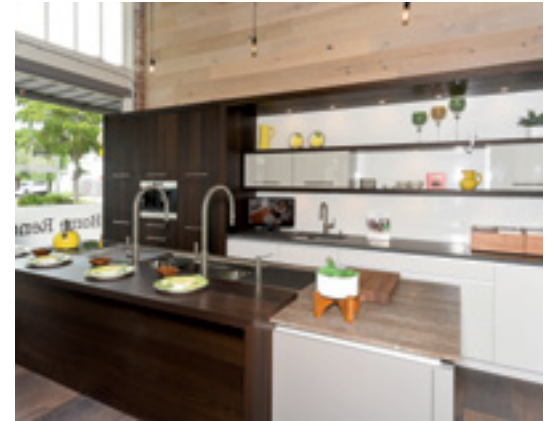
OPEN SHELVING — YODER HOMES & REMODELING

mentation of technology is in light control, where you walk into a room and you verbally request the light to be turned on. "Technology in homes is becoming smarter, and more user-friendly." A favorite from the Kitchen Bath and Industry Show was lighting technology in your home bathrooms. Motion-censored, the light will automatically turn on when you enter the room and depending on the time of day, the light will be soft or bright. At 6AM when you first wake up, it will be a dimmer, softer light and during the