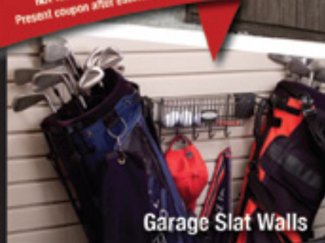
Garage Slat Walls

FREE PROFESSIONAL INSTALLATION • ALL PRODUCTS FULLY WARRANTED