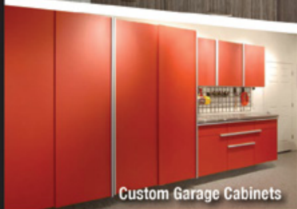
Custom Garage Cabinets

Not valid with any other offer. Present coupon after estimate is given.