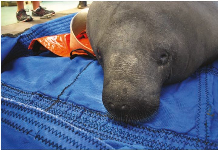
Above: A closeup of Tannebaum. Left: Tannebaum on the left, Ba a center, and ONeil on the right. The white line across the area between Tannebaum's tail and his body is the healing wound from an entanglement injury.